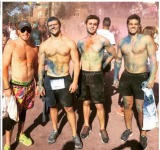
Pikes after running in the 'Color Me KD' 5K