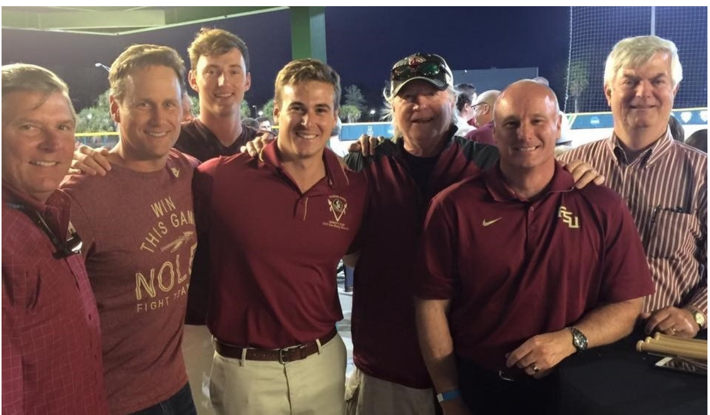
Delta Lambda Alumni at the FSU vs. U. South Florida Baseball Game in Tampa