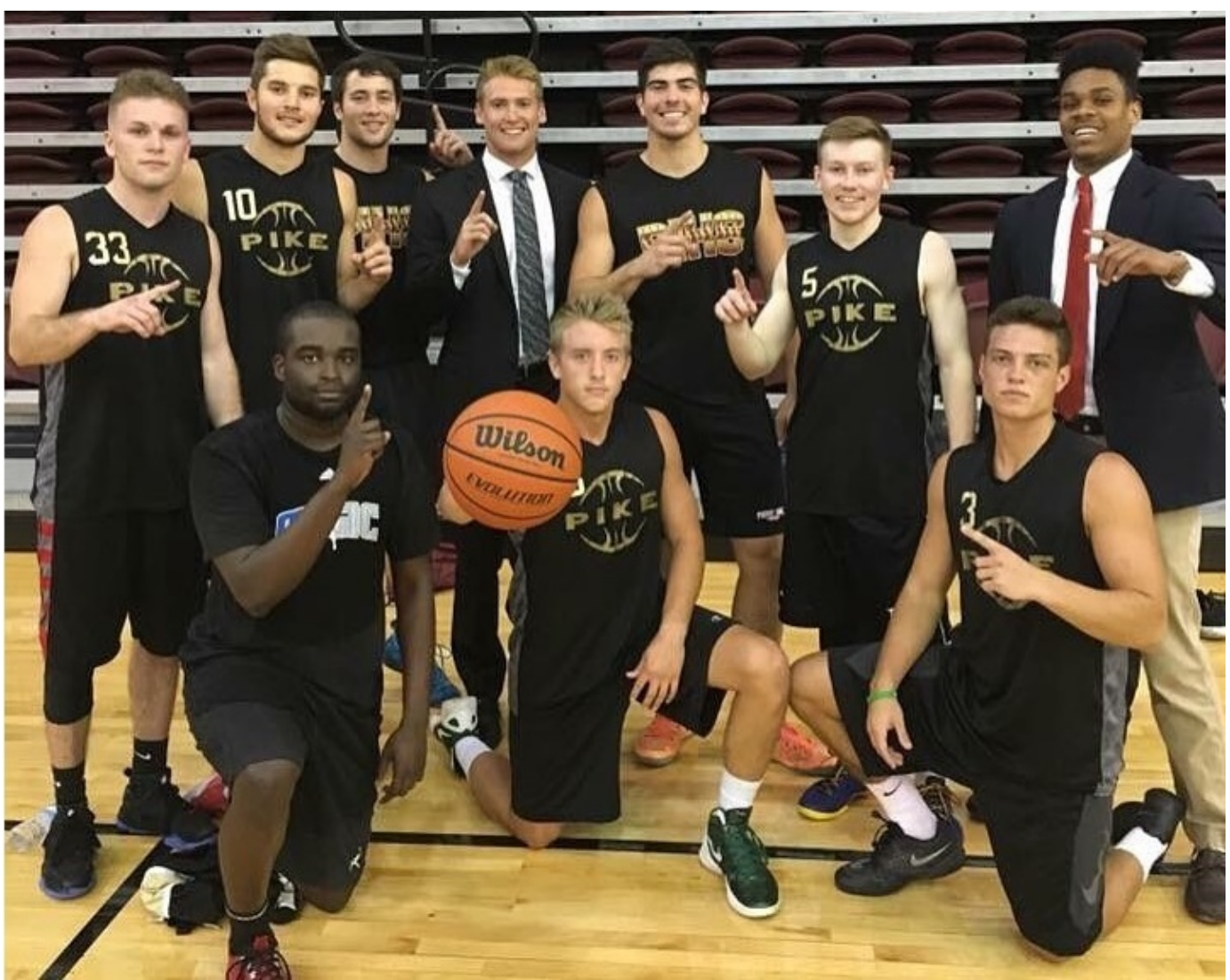
Pikes are 2016 IM Basketball Champions