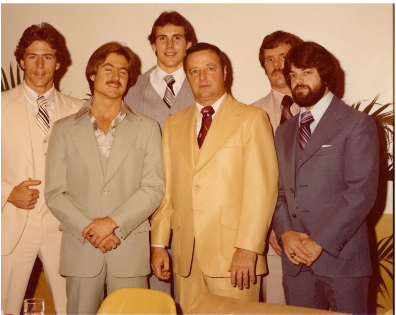
THEN AND NOW: Early 1980's Bobby Bowden Day in Melbourne (?)