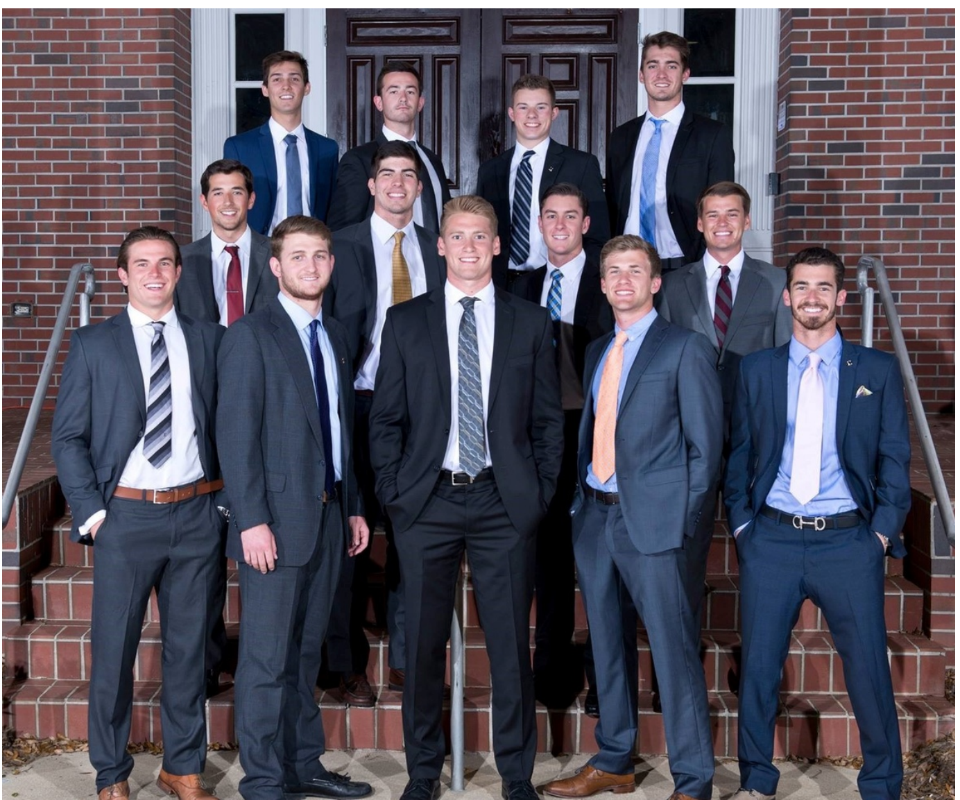
Delta Lambda Executive Committee