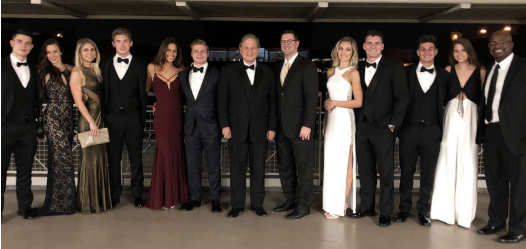
“Pike Night” at the Annual Biletnikoff Award Banquet 2-16-19

Some of Delta Lambda’s alumni advisors and key undergraduate officers were special guests at the annual black-tie Tallahassee Quarterback Club Foundation Biletnikoff Banquet, where the 2018 Biletnikoff Award for the nation’s most outstanding wide receiver was presented to the Crimson Tide’s Jerry Jeudy.