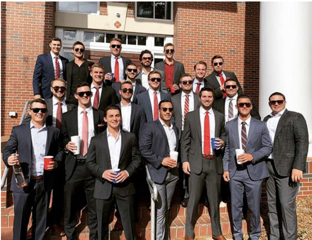
Spring, 2019 Pike Seniors at their Final Fireman's Ball

Someone posted, "Young Guns, not so young anymore..."