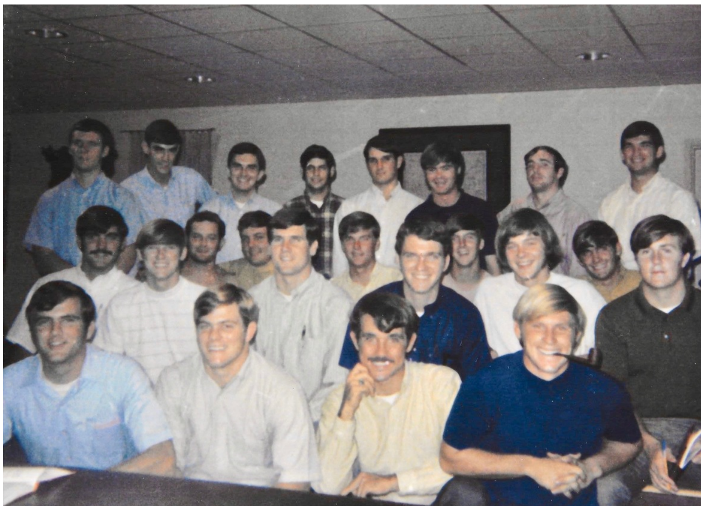
A Jpeg of the fall 1969 pledge class photo is available to you on request