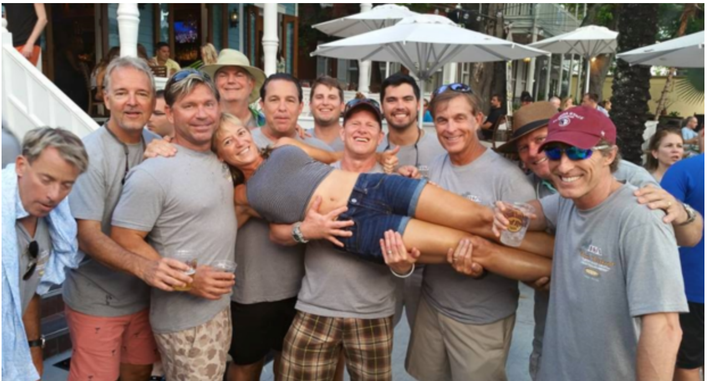
At the Hard Rock Café in Key West during Delta Lambda Alumni Weekend

After being named First Team on every collegiate All-American squad as a sophomore, Berger turned pro and earned his PGA Touring Pro card. In winning the Saint Jude Classic, Berger shot a 3-under 67 to hold off Phil Mickelson, Steve Stricker and Brooks Koepka by three strokes. Berger, 2015 Rookie of the Year, finished with a 13-under 267.