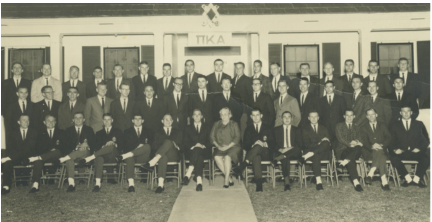
Delta Lambda Chapter, February 25 th , 1963