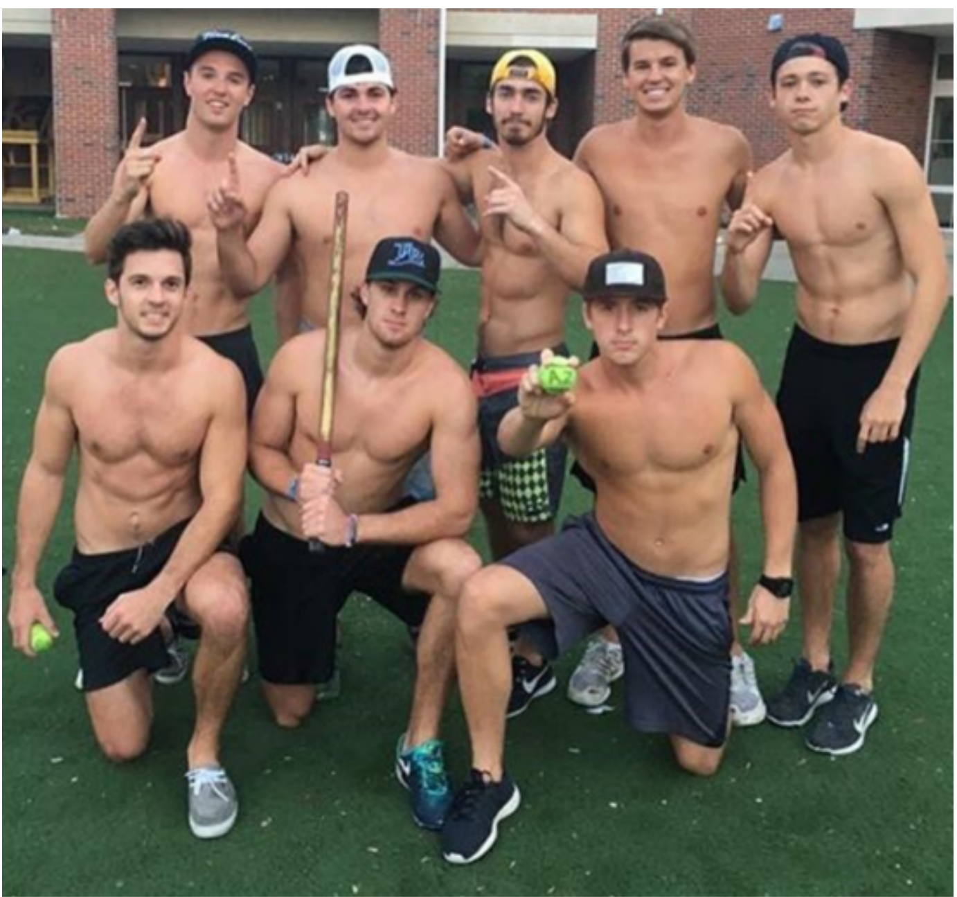
2016 Pike Stickball Champions

The two-year old PSL (Pike Stickball League) is unique and exclusive to Pike at FSU. PSL is a drafted league within the Brotherhood where teams play each other using the 7,000 square-foot Pike Courtyard as a field. At the end of every semester a Champion is crowned, and the Champions defend their title in the next school term.