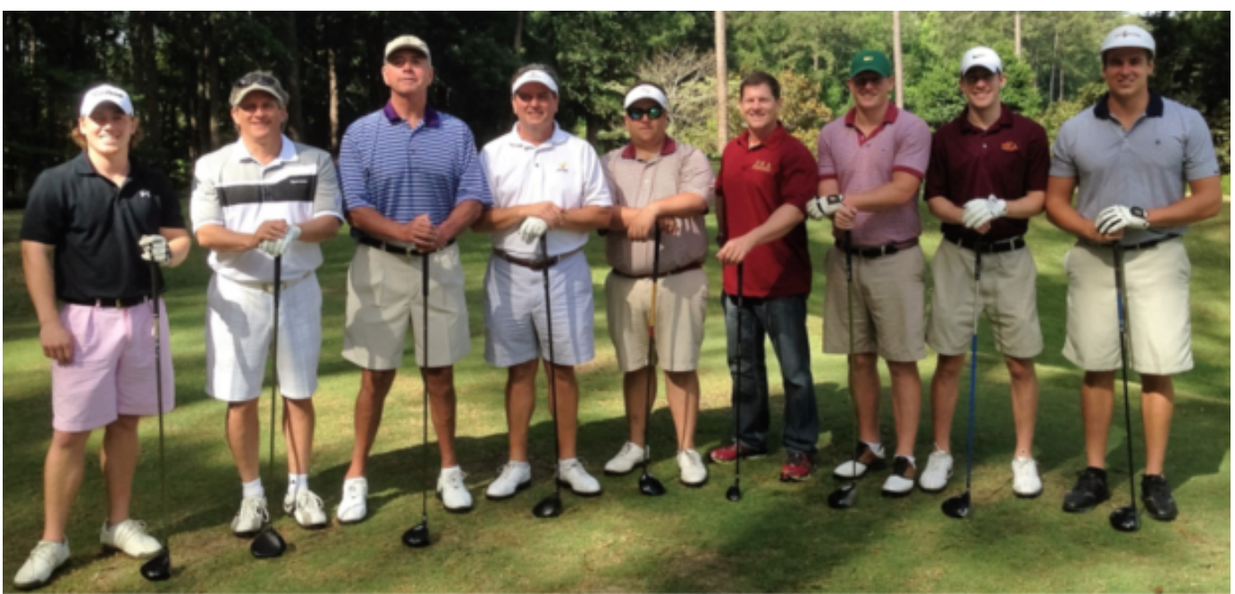
Delta Lambda Alumni Golf Tournament at Golden Eagle Country Club