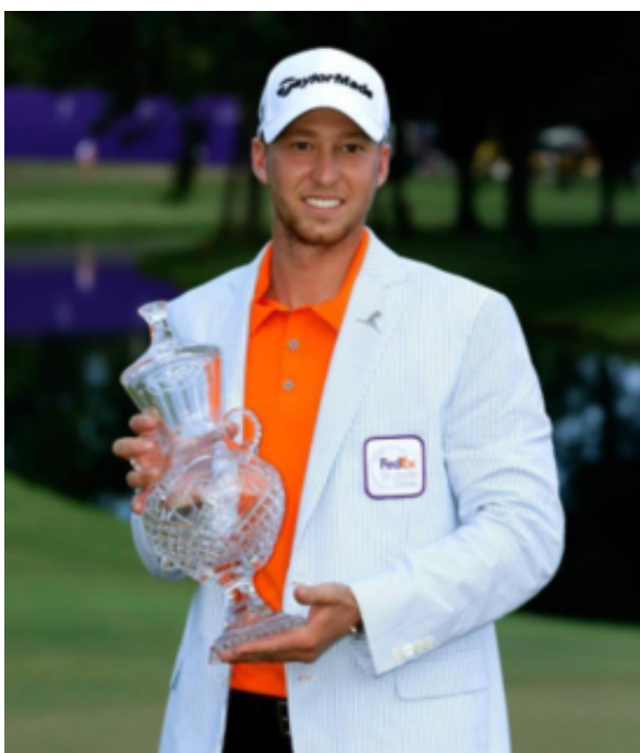
Daniel Berger '12 Wins The PGA's FedEx Saint Jude Classic in Memphis

On June 12th, Brother Daniel Berger '12 earned his first PGA Tour victory, taking the title at the FedEx Saint Jude Classic in Memphis, Tennessee along with the $1,116,000 champion's prize.