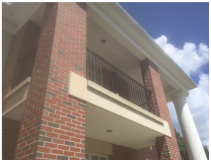
New heavy-duty railings on the balconies.