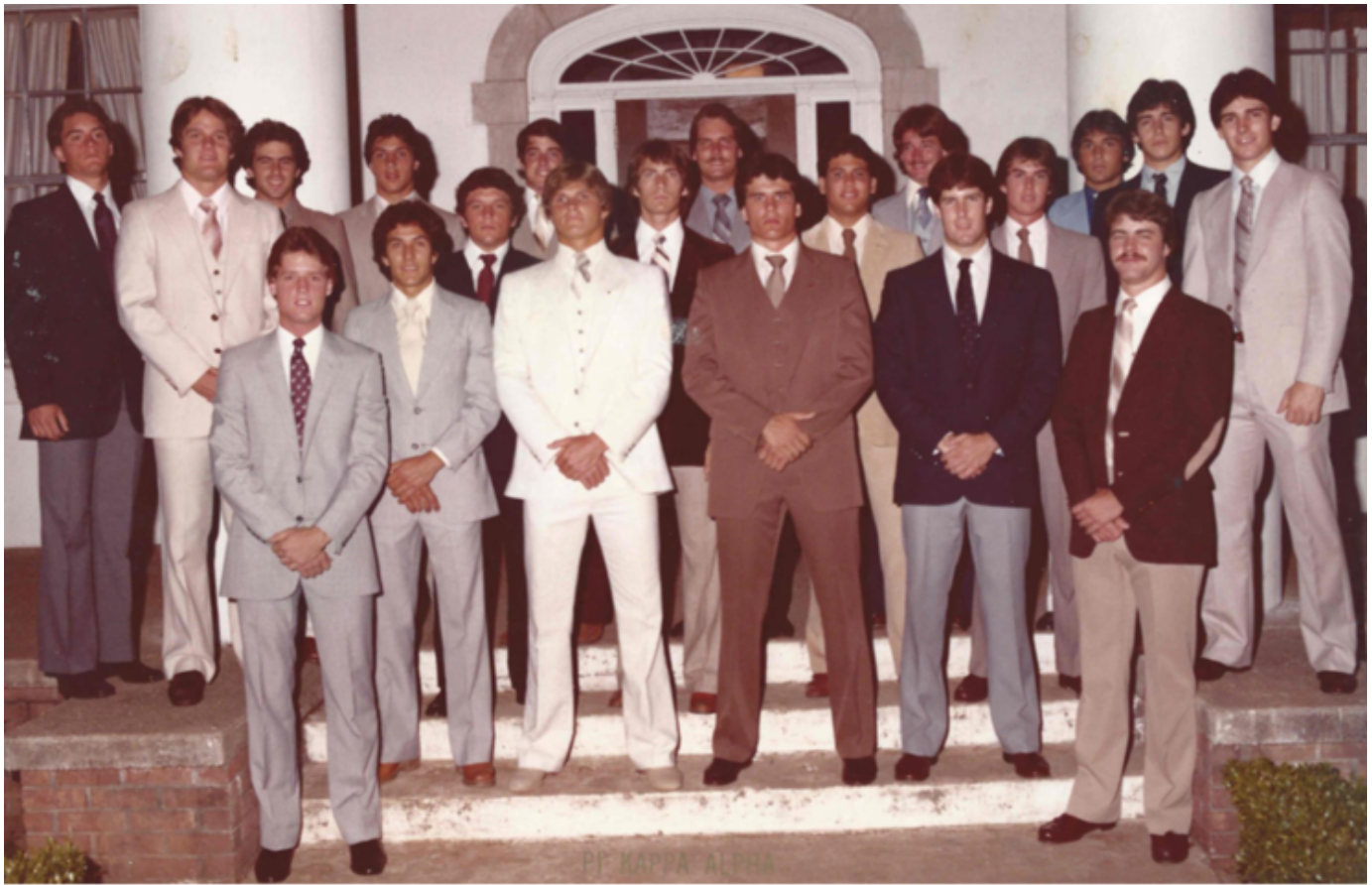
Delta Lambda Spring, 1981 Pledge Class