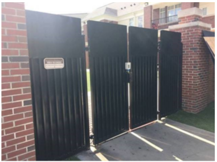
Here are exterior and interior views of the new magnetic-lock back gate entry into the courtyard.