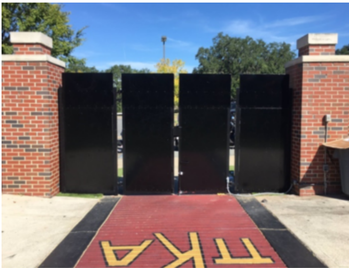
View of the new gates from inside the courtyard.