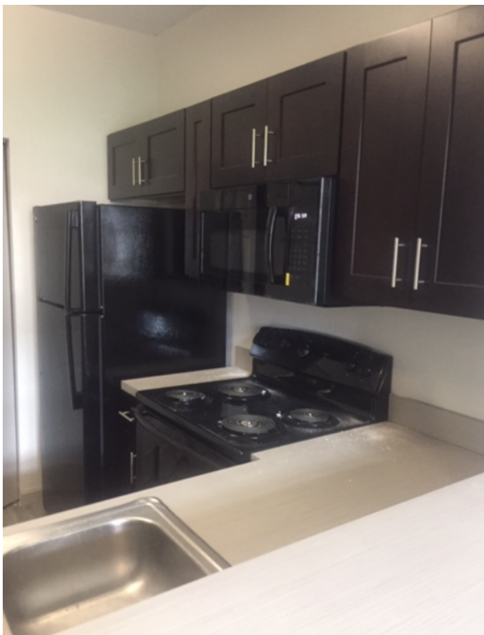
Kitchen and Sembler Hall