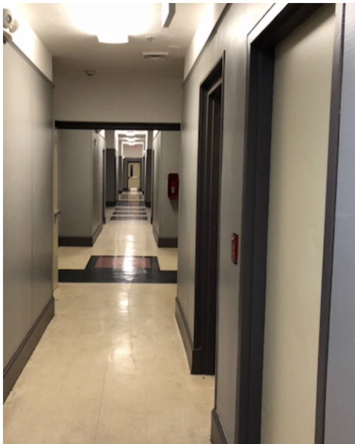
ABOVE: Ground floor, East wing

Keen added, "You can see in the photo, the floor in Sembler Hall was acid stained again during this time. It is most important to note that Brother Brent Sembler '78 paid the total cost personally..."