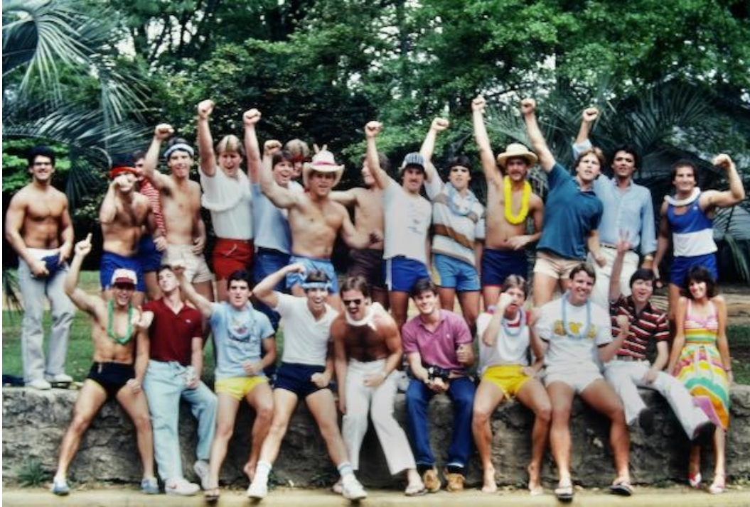
Pike Lawn Party, 40 Years Ago