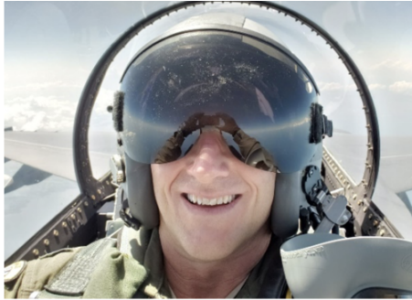
Premier F16 fighter jock