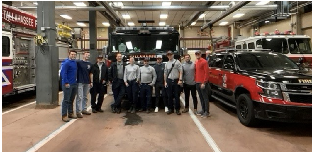
Chapter officers with local Tallahassee Fire Fighters