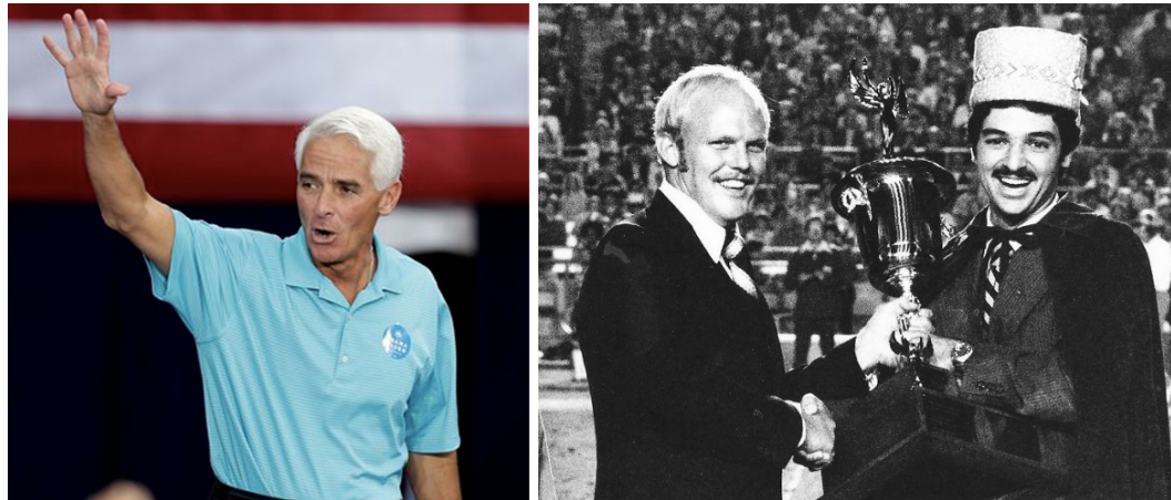
[Left] Former Florida Governor, now United States Congressman Charlie Crist '77 won re-election to the U.S. House of Representatives in Florida's 13th Congressional District (St Pete, Largo, Clearwater) this November.