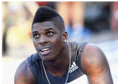
Marvin Bracy '13