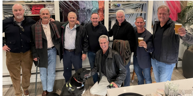
Brofest in Jacksonville, February 8, 2022.