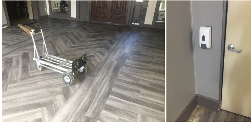
Above: New flooring in the foyer and throughout the first floor, as well as having hand sanitizers installed

Over the course of late summer and this fall, the courtyard and front exterior were primed and painted.