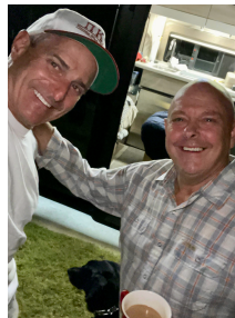
"Moon over Chicago" on 10/21/2021 at Gibson's Italia.