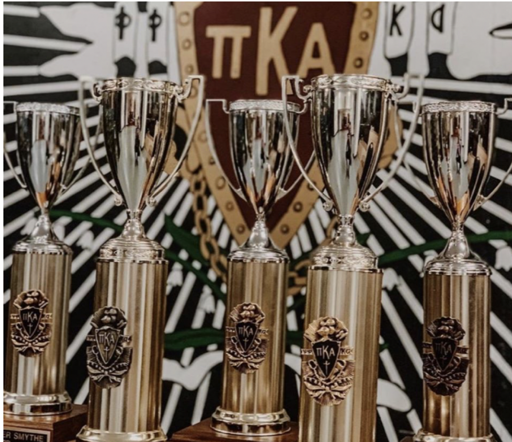
Delta Lambda Wins the Smythe in 2020!