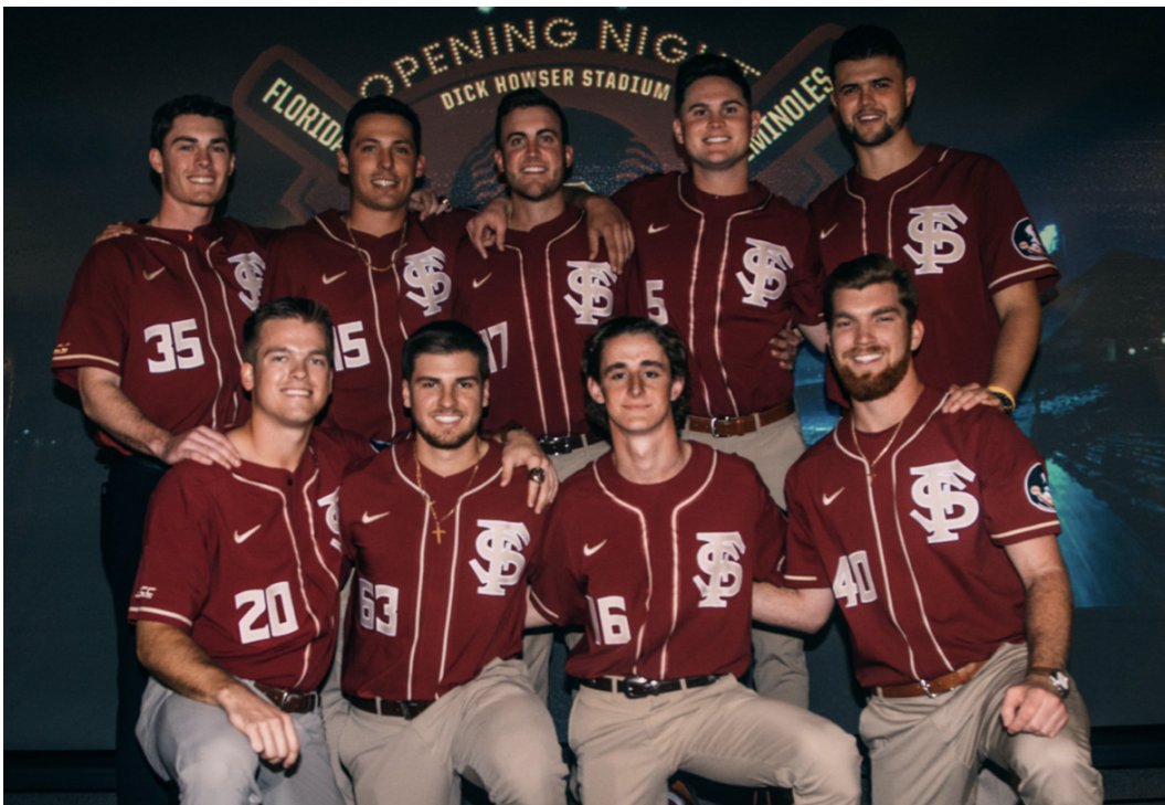
Pike Brothers on the 2020 Seminole Baseball Team