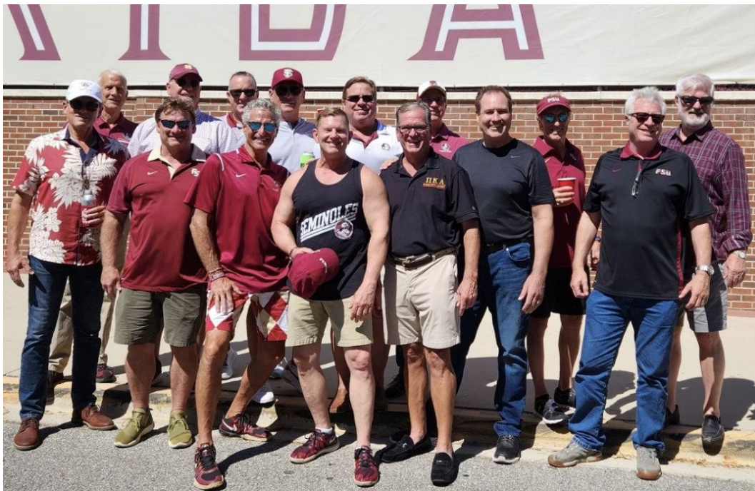
Delta Lambdas gather at the stadium for a Pre-Game celebration September 24th

Delta Lambda will celebrate our 75th Anniversary in 2024. Stay tuned as the process moves forward.